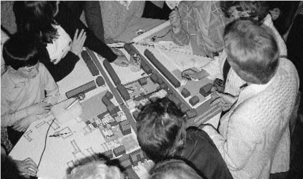
Figure 5.30 The Millgate project: working round the model.